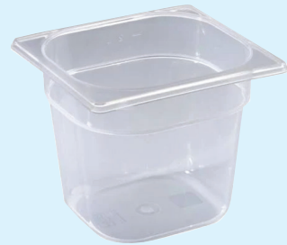
ID 30325 BACINELLA GASTR. 1/6 H.200mm. LT 2,5 142/1/6/200-PP