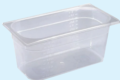
ID 30326 BACINELLA GASTR. 1/3 H.200mm. LT.7 142/1/3/200-PP