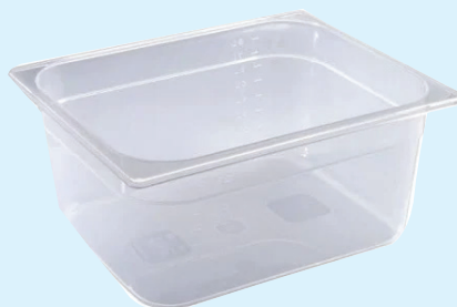
ID 17548 BACINELLA GASTR. 1/2 H.200 LT11 142/1/2/200-PP