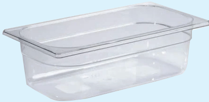
ID 31809 BACINELLA GASTR. 1/3 H.65 LT.2 142/1/3/065-PP