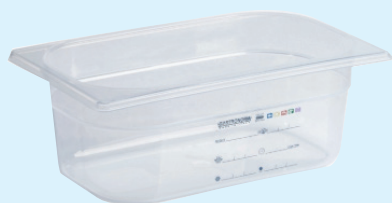
ID 10332 BACINELLA GASTR. 1/4 H.200mm. LT.4.5 PP 142/1/4/200-PP