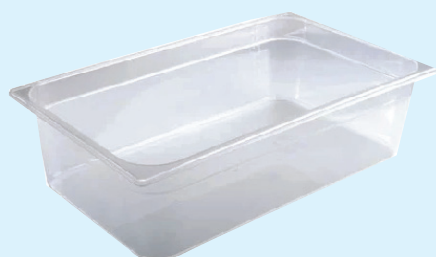
ID 17547 BACINELLA GASTR. 1/1 H.200 LT24 142/1/1/200-PP