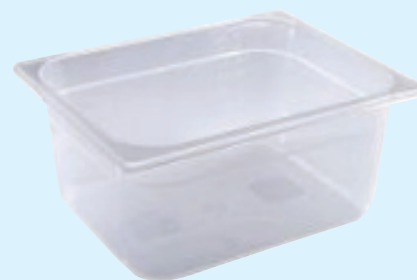
ID 17010 BACINELLA GASTR. 1/2 H.150mm. LT.8 142/1/2/150-PP