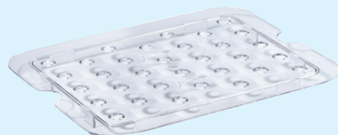
ID 31814 FALSO FONDO FORATO GASTRONORM 1/1 ID 31813 FALSO FONDO FORATO GASTRONORM 1/2 ID 31812 FALSO FONDO FORATO GASTRONORM 1/3