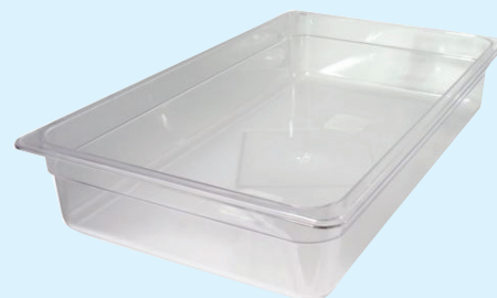
ID 6813 BACINELLA GASTR. 1/1 H.150 LT 18 142/1/1/150-PP