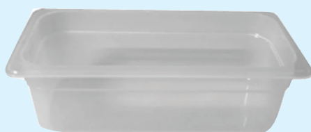
ID 17011 BACINELLA GASTR. 1/3 H.150mm. LT.5 PP 142/1/3/150-PP