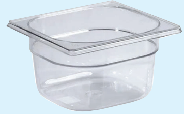
ID 31806 BACINELLA GASTR. 1/6 H.65 LT.1 142/1/6/065-PP