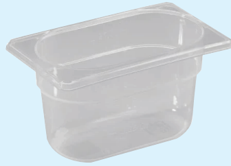
ID 18990 BACINELLA GASTR. 1/9 H.100mm. LT.0,7 142/1/9/100-PP