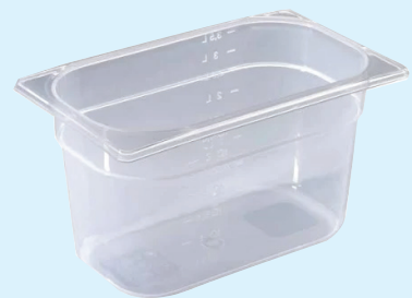
ID 17012 BACINELLA GASTR. 1/4 H.150mm. LT.3,5 142/1/4/150-PP