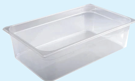
ID 31811 BACINELLA GASTR. 1/1 H.65 LT.8 142/1/1/065-PP